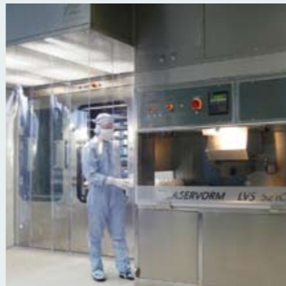
Laser egg opening under clean room conditions at IDT Biologika