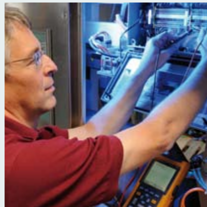
The precisely adjusted on-the-fly control ensures the eggs are transported with care