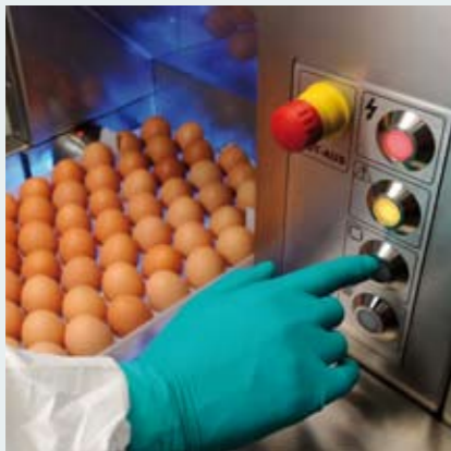
Feeding of plastic trays with eggs

Safety and cleanliness are top priorities during pharmaceutical production. The contactless working laser therefore opens up a wealth of possibilities. As sole global supplier, we offer pharmaceutical manufacturers a special machine solution to the sterile opening of eggs. You too can profit by the advantages of the laser: We will support you from the initial concept right up to project implementation.